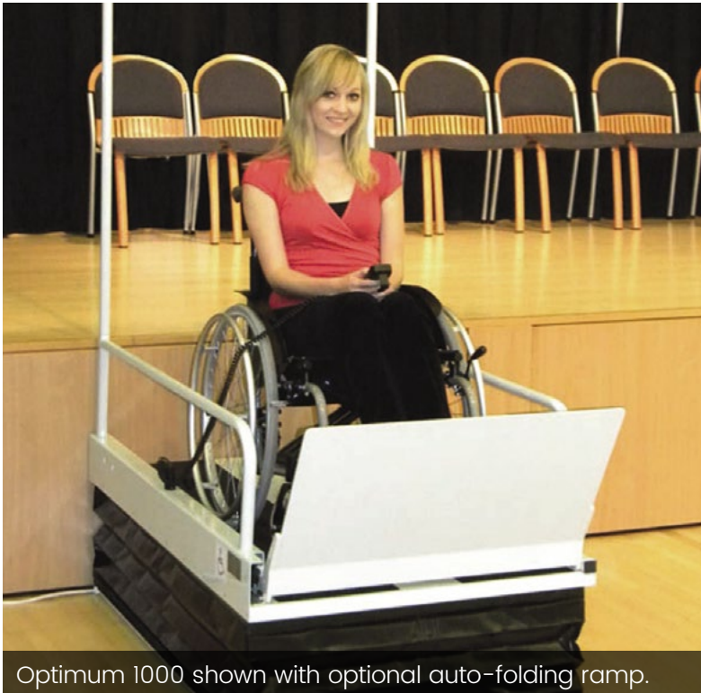
Optimum 1000 shown with optional auto-folding ramp.