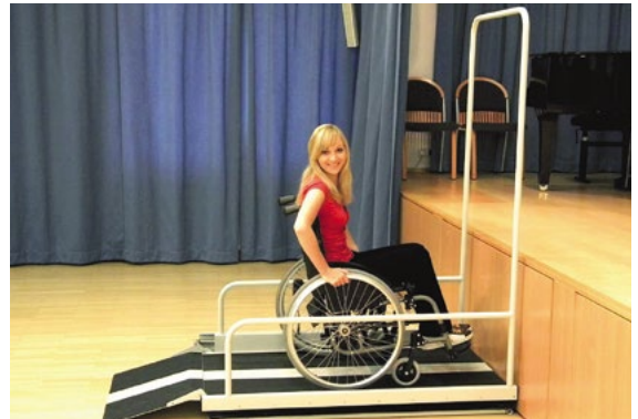
Optimum 1000 shown in use for stage access with optional upper safety bar