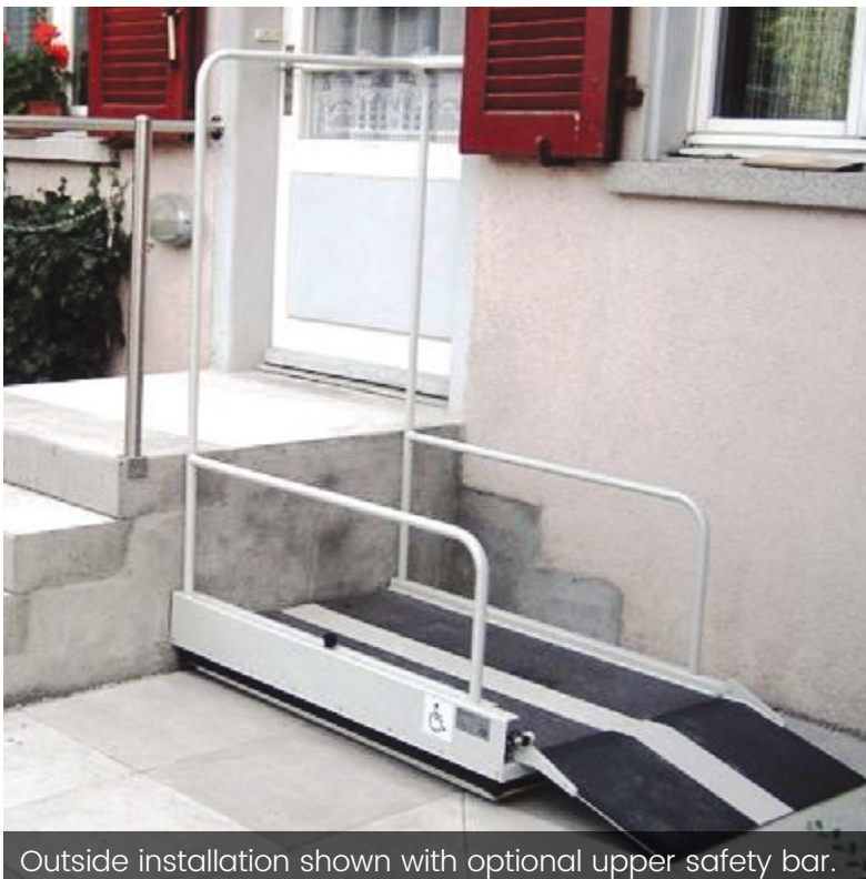
Outside installation shown with optional upper safety bar.

Ideal for corporate events, schools, theatres and stages, the Optimum 1000 has a safety access ramp fitted to the leading edge that will raise by 100mm when the lift is in use to restrain wheelchairs. A handset on a spiral cable is provided and the unit is finished in Grey RAL 7035. A range of options and special RAL colours are available, please call us to discuss your requirements in more detail.